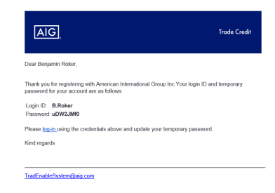
User registration email

NOTE: Once you have clicked the log-in link, you may wish to bookmark the web address for faster access in the future.