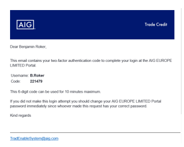
Two-factor authentication email